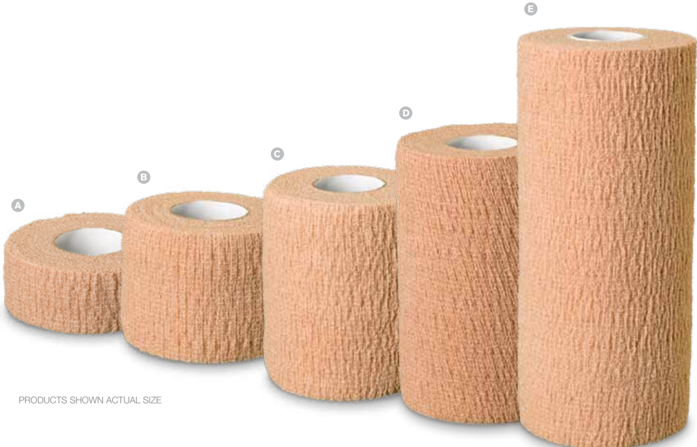
PRODUCTS SHOWN ACTUAL SIZE

CoFlex® NL The first latex-free bandage to be truly cohesive, CoFlex® NL is easy to apply, will not constrict and easily tears clean. Non-sterile CoFlex® NL rolls are five yards in length and available in five widths.