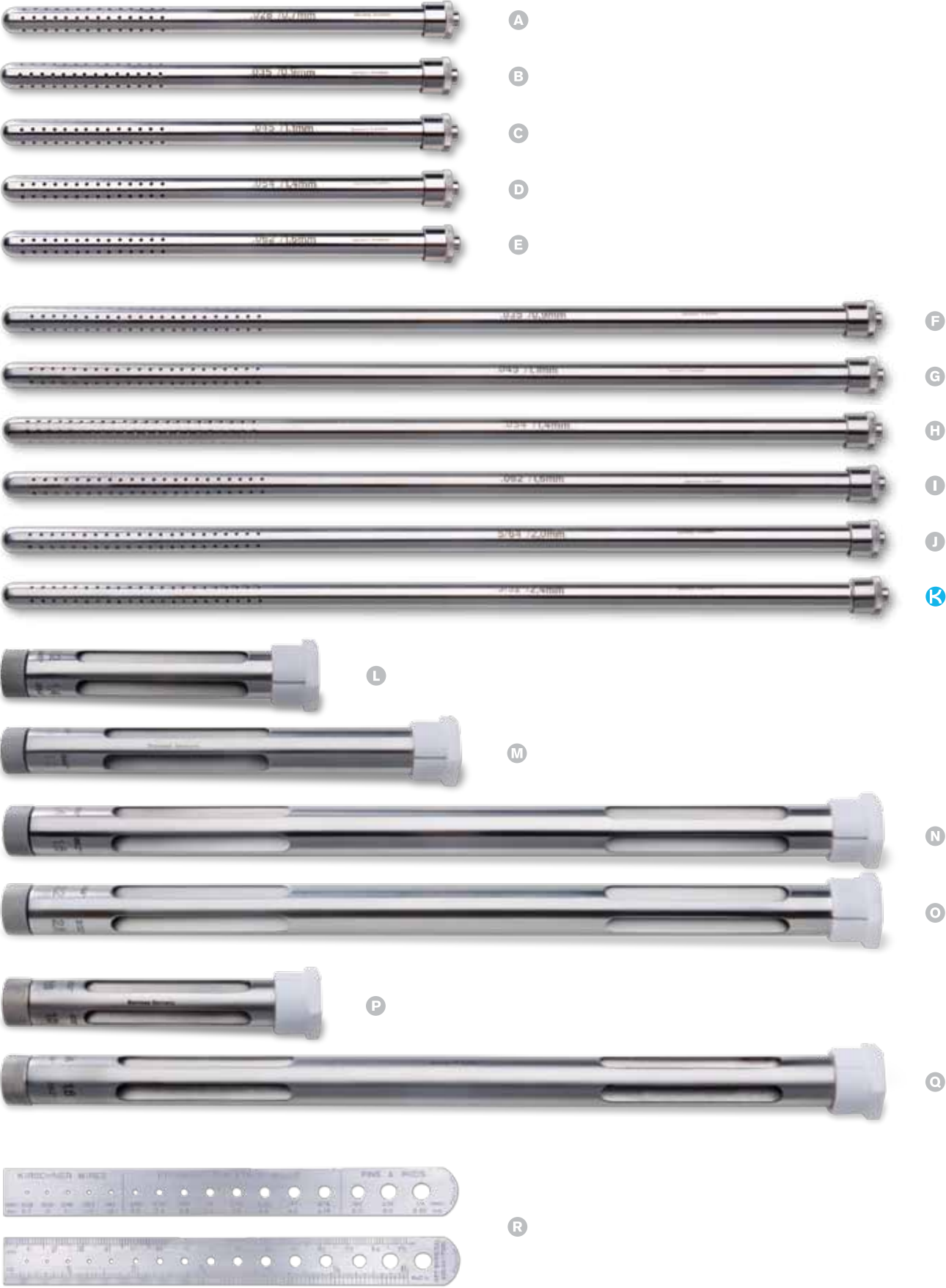
PRODUCTS SHOWN 50% ACTUAL SIZE